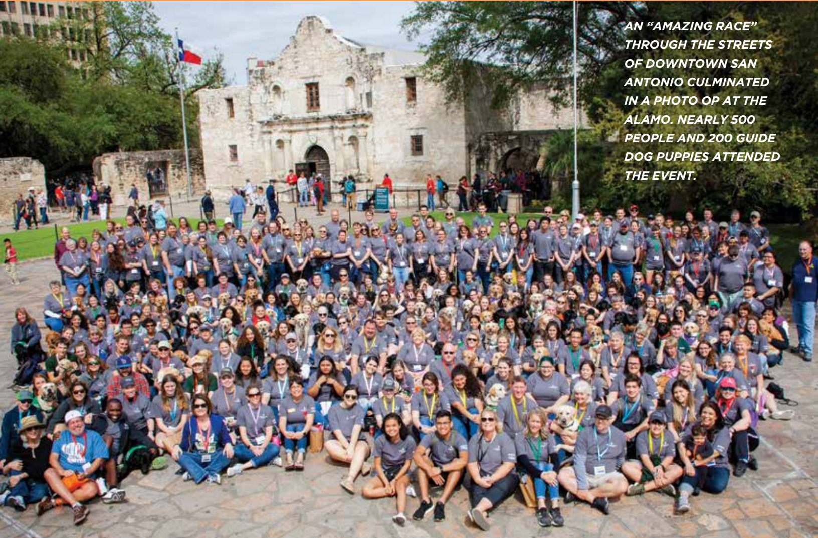
AN "AMAZING RACE" THROUGH THE STREETS OF DOWNTOWN SAN ANTONIO CULMINATED IN A PHOTO OP AT THE ALAMO. NEARLY 500 PEOPLE AND 200 GUIDE DOG PUPPIES ATTENDED THE EVENT.

The Texas statewide Fun Day held in March in San Antonio had everything you would expect from an event in the Lone Star State: line dancing, barbecue, and big adventures! It was a weekend of educational and fun-filled activities for our puppy raisers, clients, volunteers, and dogs.