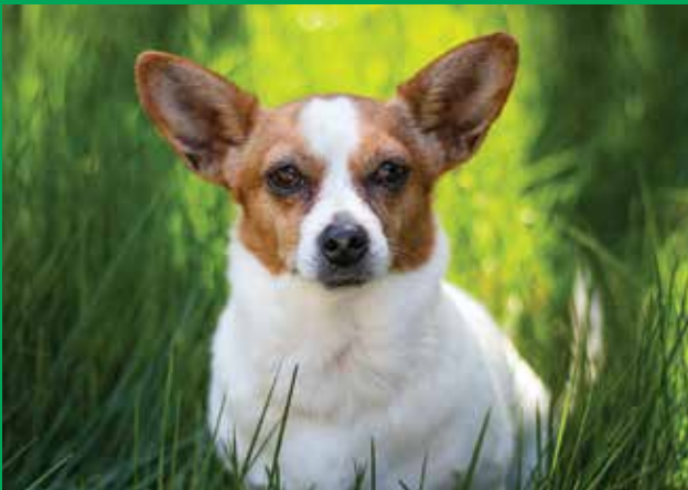
OVERALL WINNER/PET POOCH CATEGORY: WALLY BOCCALINI

From apparel and dog supplies, to GDB-branded accessories, we've got something for everyone in our online gift shop. Check it out at guidedogs.com/shop .